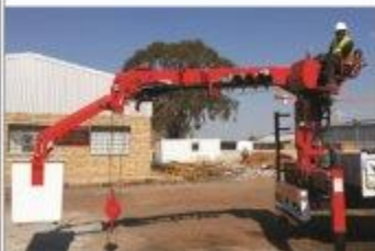
(SC313ML) WORKING RANGE